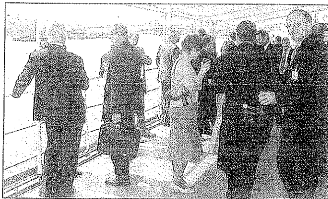
SP12 Launch - HQS Wellington

There were concerns about the impending shortage of foreign labour as the existing Eastern European employees are returning home rich and able to jump in and make large